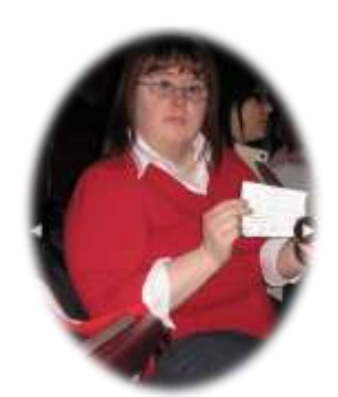
January 15, 1974 -March 31, 2017

Special Olympics Newfoundland and Labrador would like to remember the following members that have passed away over the last year.